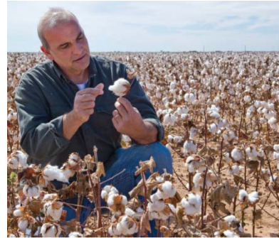
BeirTex spinning technology